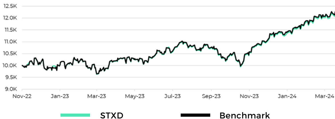
Chart reflects growth of a hypothetical $10,000 investment and assumes reinvestment of dividends and capital gains. Past performance is not indicative of future results. Index performance may differ from fund performance. Indexes are not managed, and one cannot invest directly into an index

Investors should consider the investment objectives, risks, charges and expenses carefully before investing. For a prospectus or summary prospectus with this and other information about the Fund, please call 855-427-7360 or visit our website at www.strivefunds.com . Read the prospectus or summary prospectus carefully before investing.