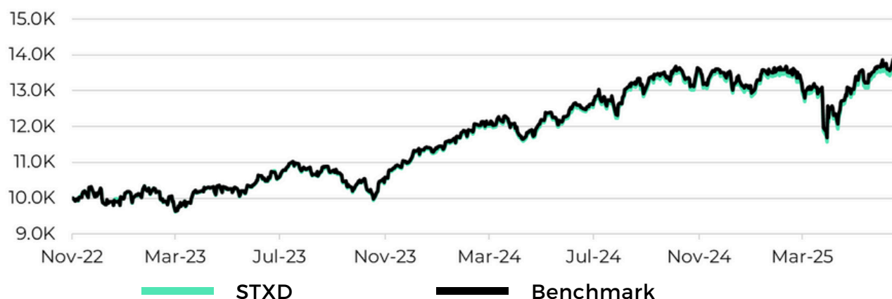
Chart reflects growth of a hypothetical $10,000 investment and assumes reinvestment of dividends and capital gains. Past performance is not indicative of future results. Index performance may differ from fund performance. Indexes are not managed, and one cannot invest directly into an index

Investors should consider the investment objectives, risks, charges and expenses carefully before investing. For a prospectus or summary prospectus with this and other information about the Fund, please call 855-427-7360 or visit our website at www.strivefunds.com . Read the prospectus or summary prospectus carefully before investing.