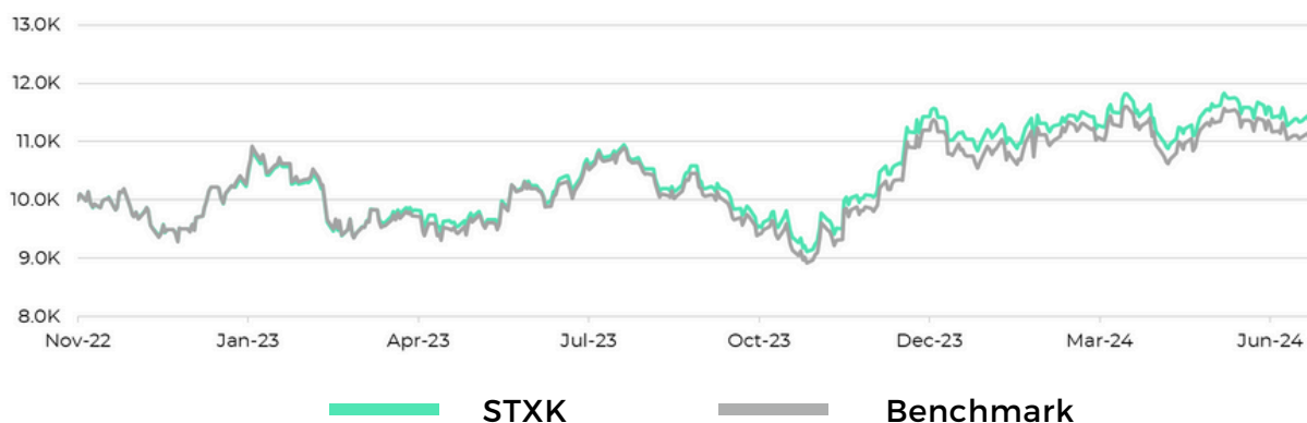
Chart reflects growth of a hypothetical $10,000 investment and assumes reinvestment of dividends and capital gains. Past performance is not indicative of future results. Index performance may differ from fund performance. Indexes are not managed, and one cannot invest directly into an index

Investors should consider the investment objectives, risks, charges and expenses carefully before investing. For a prospectus or summary prospectus with this and other information about the Fund, please call 855-427-7360 or visit our website at www.strivefunds.com . Read the prospectus or summary prospectus carefully before investing.