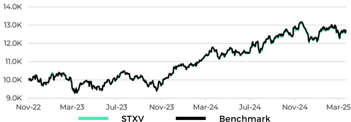
Chart reflects growth of a hypothetical $10,000 investment and assumes reinvestment of dividends and capital gains. Past performance is not indicative of future results. Index performance may differ from fund performance. Indexes are not managed, and one cannot invest directly into an index

Investors should consider the investment objectives, risks, charges and expenses carefully before investing. For a prospectus or summary prospectus with this and other information about the Fund, please call 855-427-7360 or visit our website at www.strivefunds.com . Read the prospectus or summary prospectus carefully before investing.