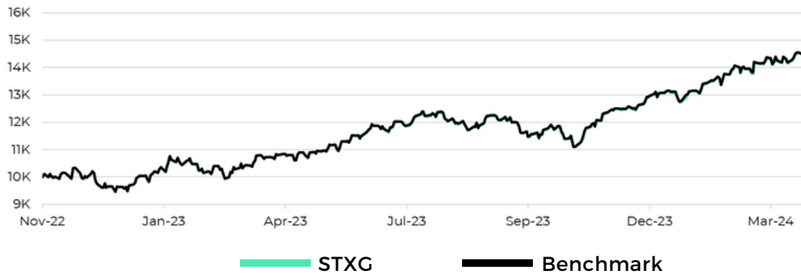
Chart reflects growth of a hypothetical $10,000 investment and assumes reinvestment of dividends and capital gains. Past performance is not indicative of future results. Index performance may differ from fund performance. Indexes are not managed, and one cannot invest directly into an index

Investors should consider the investment objectives, risks, charges and expenses carefully before investing. For a prospectus or summary prospectus with this and other information about the Fund, please call 855-427-7360 or visit our website at www.strivefunds.com . Read the prospectus or summary prospectus carefully before investing.