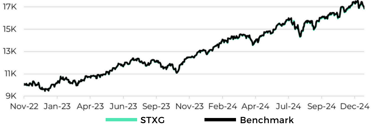
Chart reflects growth of a hypothetical $10,000 investment and assumes reinvestment of dividends and capital gains. Past performance is not indicative of future results. Index performance may differ from fund performance. Indexes are not managed, and one cannot invest directly into an index

Investors should consider the investment objectives, risks, charges and expenses carefully before investing. For a prospectus or summary prospectus with this and other information about the Fund, please call 855-427-7360 or visit our website at www.strivefunds.com . Read the prospectus or summary prospectus carefully before investing.