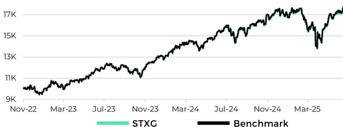
Chart reflects growth of a hypothetical $10,000 investment and assumes reinvestment of dividends and capital gains. Past performance is not indicative of future results. Index performance may differ from fund performance. Indexes are not managed, and one cannot invest directly into an index

Investors should consider the investment objectives, risks, charges and expenses carefully before investing. For a prospectus or summary prospectus with this and other information about the Fund, please call 855-427-7360 or visit our website at www.strivefunds.com . Read the prospectus or summary prospectus carefully before investing.