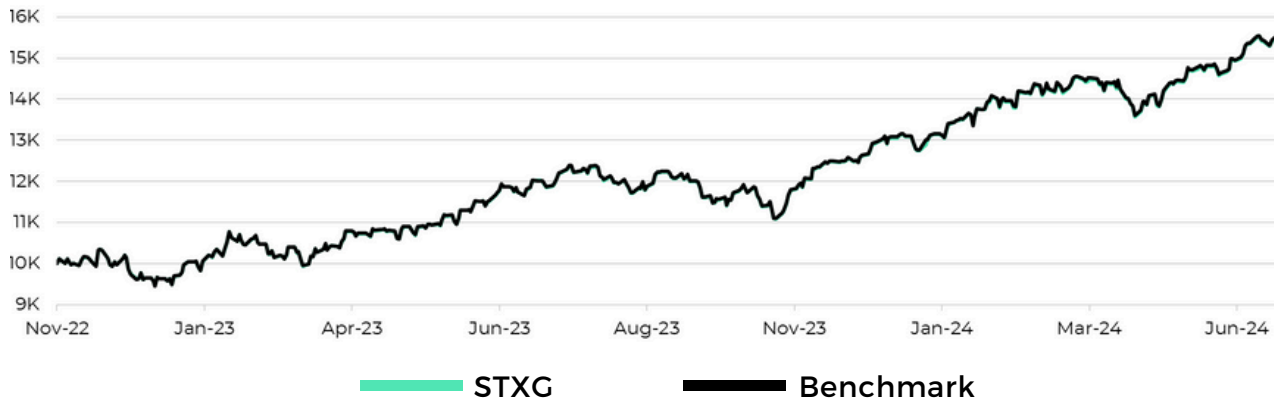
Chart reflects growth of a hypothetical $10,000 investment and assumes reinvestment of dividends and capital gains. Past performance is not indicative of future results. Index performance may differ from fund performance. Indexes are not managed, and one cannot invest directly into an index

Investors should consider the investment objectives, risks, charges and expenses carefully before investing. For a prospectus or summary prospectus with this and other information about the Fund, please call 855-427-7360 or visit our website at www.strivefunds.com . Read the prospectus or summary prospectus carefully before investing.