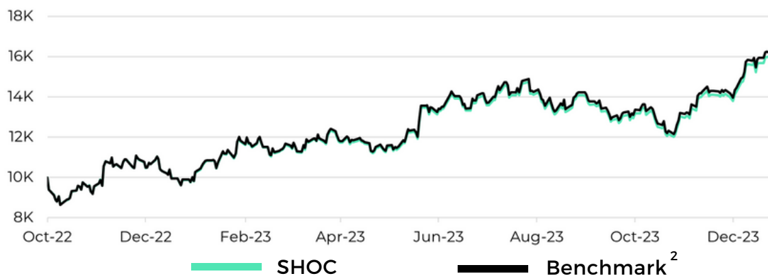
Chart reflects growth of a hypothetical $10,000 investment and assumes reinvestment of dividends and capital gains. Past performance is not indicative of future results. Index performance may differ from fund performance. Indexes are not managed, and one cannot invest directly into an index

Investors should consider the investment objectives, risks, charges and expenses carefully before investing. For a prospectus or summary prospectus with this and other information about the Fund, please call 855-427-7360 or visit our website at www.strivefunds.com . Read the prospectus or summary prospectus carefully before investing.