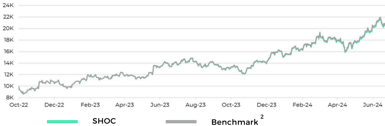
Chart reflects growth of a hypothetical $10,000 investment and assumes reinvestment of dividends and capital gains. Past performance is not indicative of future results. Index performance may differ from fund performance. Indexes are not managed, and one cannot invest directly into an index

Investors should consider the investment objectives, risks, charges and expenses carefully before investing. For a prospectus or summary prospectus with this and other information about the Fund, please call 855-427-7360 or visit our website at www.strivefunds.com . Read the prospectus or summary prospectus carefully before investing.