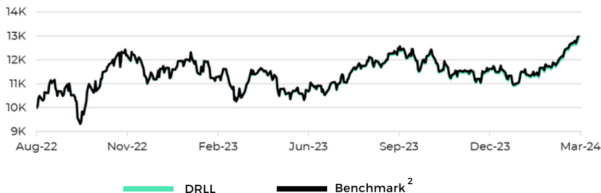
Chart reflects growth of a hypothetical $10,000 investment and assumes reinvestment of dividends and capital gains. Past performance is not indicative of future results. Index performance may differ from fund performance. Indexes are not managed, and one cannot invest directly into an index.

Investors should consider the investment objectives, risks, charges and expenses carefully before investing. For a prospectus or summary prospectus with this and other information about the Fund, please call 855-427-7360 or visit our website at www.strivefunds.com . Read the prospectus or summary prospectus carefully before investing.