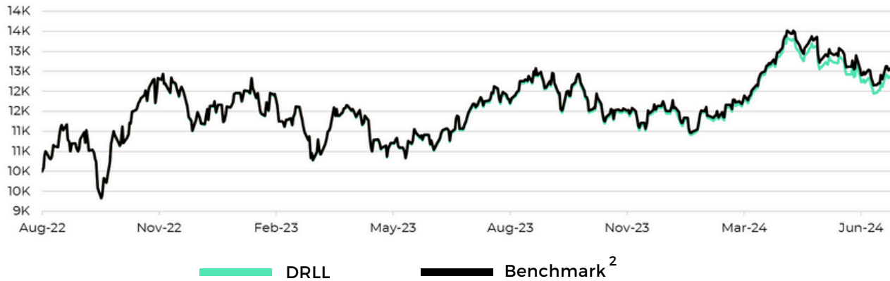
Chart reflects growth of a hypothetical $10,000 investment and assumes reinvestment of dividends and capital gains. Past performance is not indicative of future results. Index performance may differ from fund performance. Indexes are not managed, and one cannot invest directly into an index.

Investors should consider the investment objectives, risks, charges and expenses carefully before investing. For a prospectus or summary prospectus with this and other information about the Fund, please call 855-427-7360 or visit our website at www.strivefunds.com . Read the prospectus or summary prospectus carefully before investing.