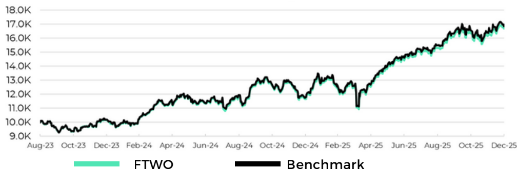
Chart reflects growth of a hypothetical $10,000 investment and assumes reinvestment of dividends and capital gains. Past performance is not indicative of future results. Index performance may differ from fund performance. Indexes are not managed, and one cannot invest directly into an index

Investors should consider the investment objectives, risks, charges and expenses carefully before investing. For a prospectus or summary prospectus with this and other information about the Fund, please call 855-427-7360 or visit our website at www.strivefunds.com . Read the prospectus or summary prospectus carefully before investing.