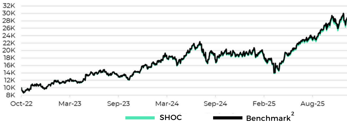
Chart reflects growth of a hypothetical $10,000 investment and assumes reinvestment of dividends and capital gains. Past performance is not indicative of future results. Index performance may differ from fund performance. Indexes are not managed, and one cannot invest directly into an index

Investors should consider the investment objectives, risks, charges and expenses carefully before investing. For a prospectus or summary prospectus with this and other information about the Fund, please call 855-427-7360 or visit our website at www.strivefunds.com . Read the prospectus or summary prospectus carefully before investing.