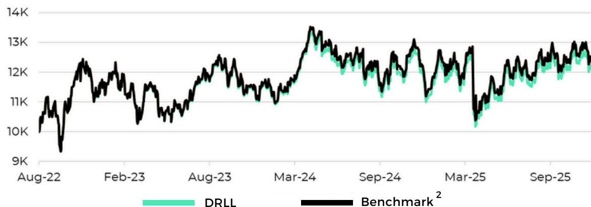
Chart reflects growth of a hypothetical $10,000 investment and assumes reinvestment of dividends and capital gains. Past performance is not indicative of future results. Index performance may differ from fund performance. Indexes are not managed, and one cannot invest directly into an index.

Investors should consider the investment objectives, risks, charges and expenses carefully before investing. For a prospectus or summary prospectus with this and other information about the Fund, please call 855-427-7360 or visit our website at www.strivefunds.com . Read the prospectus or summary prospectus carefully before investing.