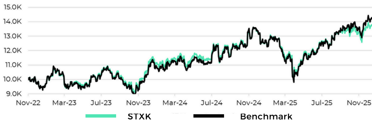
Chart reflects growth of a hypothetical $10,000 investment and assumes reinvestment of dividends and capital gains. Past performance is not indicative of future results. Index performance may differ from fund performance. Indexes are not managed, and one cannot invest directly into an index

Investors should consider the investment objectives, risks, charges and expenses carefully before investing. For a prospectus or summary prospectus with this and other information about the Fund, please call 855-427-7360 or visit our website at www.strivefunds.com . Read the prospectus or summary prospectus carefully before investing.