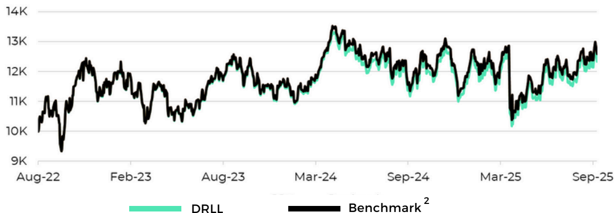
Chart reflects growth of a hypothetical $10,000 investment and assumes reinvestment of dividends and capital gains. Past performance is not indicative of future results. Index performance may differ from fund performance. Indexes are not managed, and one cannot invest directly into an index.

Investors should consider the investment objectives, risks, charges and expenses carefully before investing. For a prospectus or summary prospectus with this and other information about the Fund, please call 855-427-7360 or visit our website at www.strivefunds.com . Read the prospectus or summary prospectus carefully before investing.