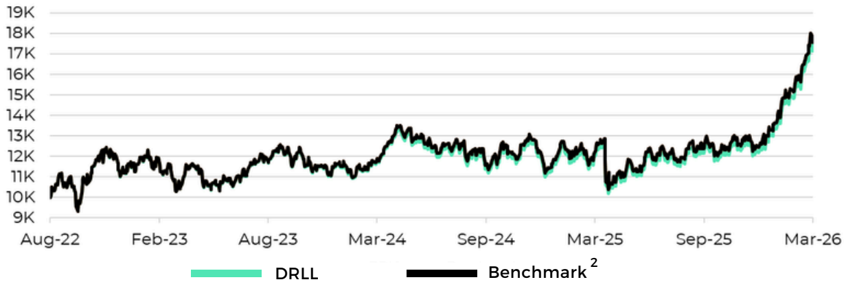
Chart reflects growth of a hypothetical $10,000 investment and assumes reinvestment of dividends and capital gains. Past performance is not indicative of future results. Index performance may differ from fund performance. Indexes are not managed, and one cannot invest directly into an index.

Investors should consider the investment objectives, risks, charges and expenses carefully before investing. For a prospectus or summary prospectus with this and other information about the Fund, please call 855-427-7360 or visit our website at www.strivefunds.com . Read the prospectus or summary prospectus carefully before investing.